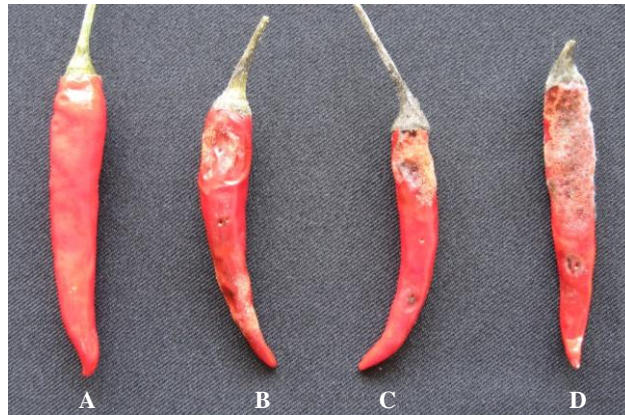
Figure 2 Pathogenicity test of carbendazim-resistant Colletotrichum gloeosporioides on chili fruits. Non-inoculated (A) and inoculated fruits (B-D)

The lesion size from pathogenicity tests grouped into five categories as followed: 3 isolates (20.00%) include isolates MPJc1, TPCMcc53 and TPCMcg60 were very high virulent group, another 3 isolates (20.00%) were high virulent group include isolates MRCMCg46, SSCMCg78 and TPCMcc9. Seven isolates (46.67%) include isolates KNKCg5, MHCMcc11, SSCMCc86, SSCMCg27, SSCMCg30, TPCMcc43 and TPCMcc75 were moderately virulent group while 2 isolates (13.33%) include MHCMcg10 and SSCMCg28 were low virulent isolates and no non-pathogenic group was investigated (Table 4).