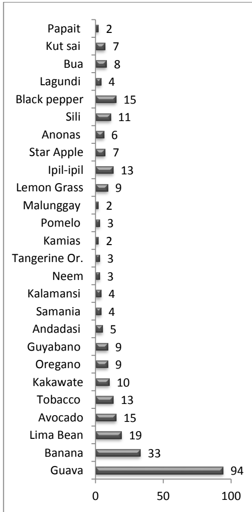
Figure 2.a Total number of EVB-M materials used by the respondents